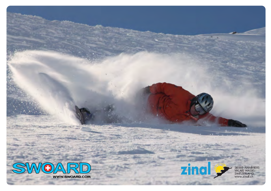
CARVING MEETING - SWOARD SNOWBOARDS TESTS - DEMOS info: www.extremecarving.com / www.swoard.com